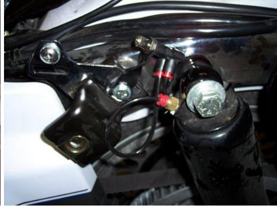
Step 15 & 19- Installation of Schrader Valve with Relocation Bracket

Bushtec Products Corporation 180 Mt. Paran Rd. Jacksboro, TN 37757 (888) 321-2516 * (423) 562-9911 Fax www.bushtec.com * E-mail info@bushtec.com