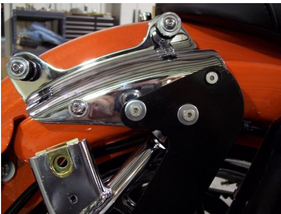
Step 8- Top of Strut Installation with 3 Bolts and Docking Hardware