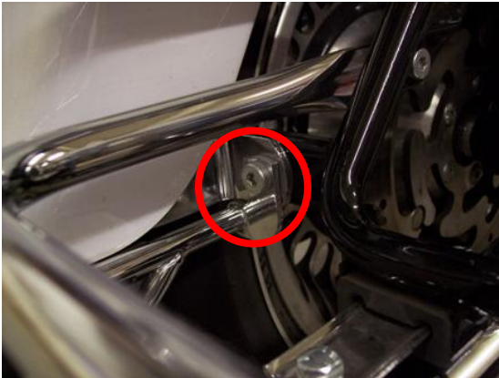
Step 5- Bolt connecting Lower Saddlebag Support to Rear Fender Support Plate highlighted

All Manufacturers names, model designations, brand names, trademarks and registered trademarks are the property of their respective holders.