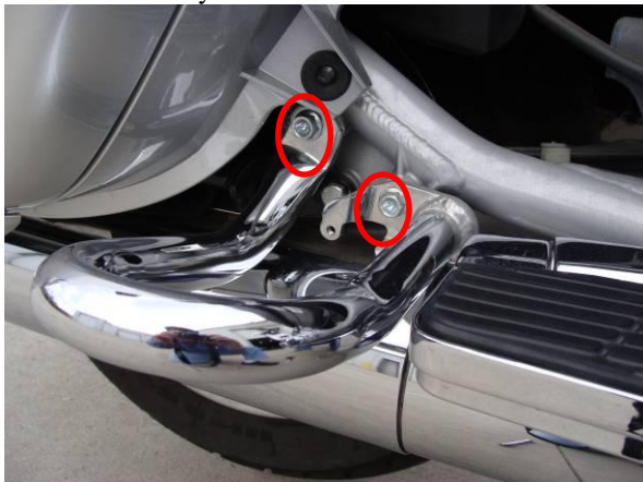
With plastic cover removed, rear saddlebag bolts are exposed.