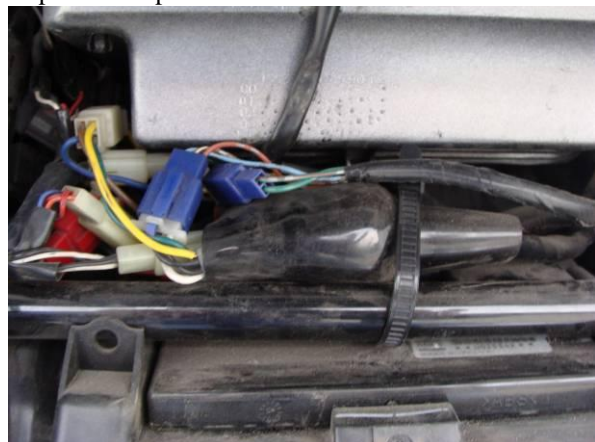
Rear of motorcycle, behind rear fender panel above rear tire. Black boot is location of plugs where