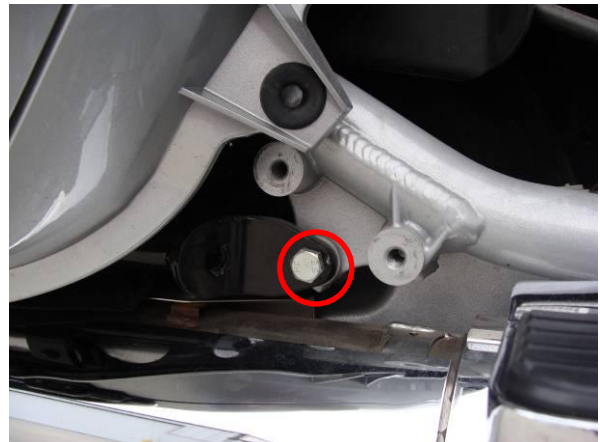
Bolt securing subframe to main frame. Remove and replace with provided bolts one side at a time.