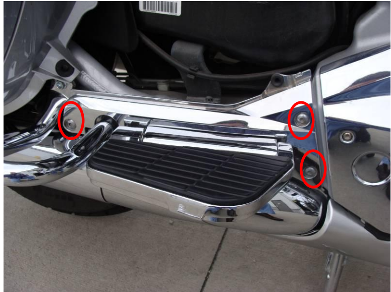
Plastic cover over frame behind passenger board. Remove three screws as highlighted to remove panel.